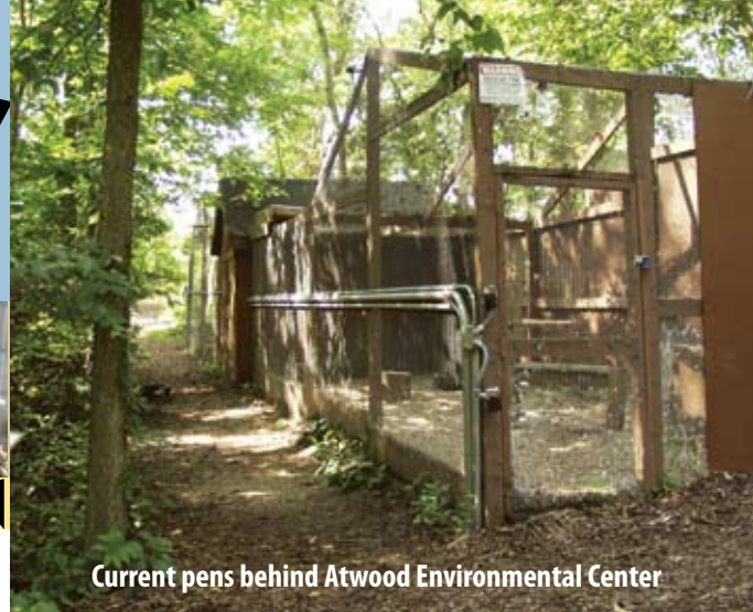
Current pens behind Atwood Environmental Center